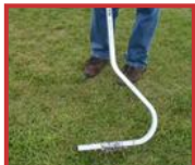
Power stick 12"